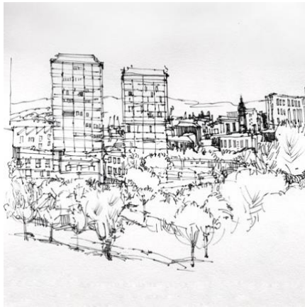
Liz Reid, Glasgow - Ecosse